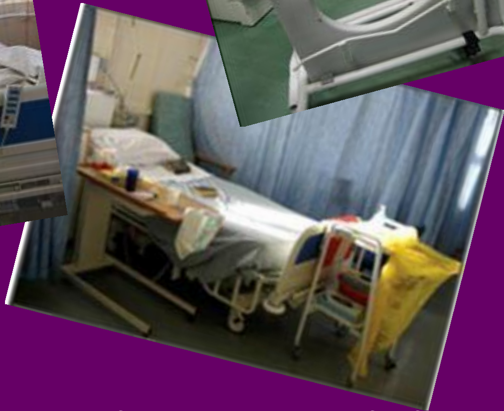
Hygiene Code Inspection report, HealthCare Commission. 2008